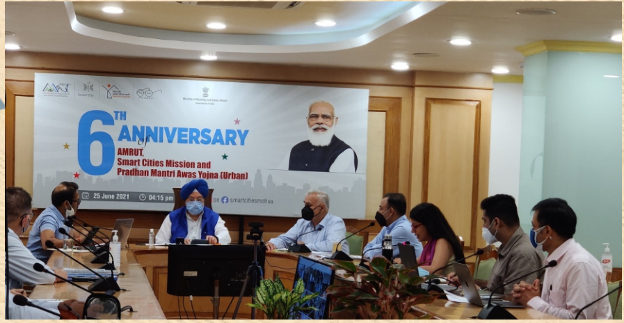
Glimpse of 6th Anniversary Celebration of PMAY(U)