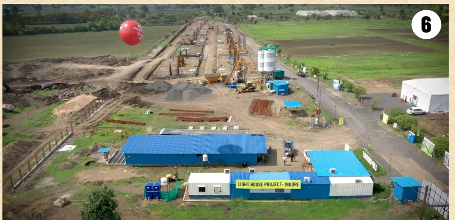
Aerial view of LHP Indore

1) In Agartala, houses are being built with New Zeland's Light Gauge Steel Structural System & Pre-Engineered Steel Structural System Technology. 2) Germany's Precast Concrete Construction System-3D Precast Volumetric technology is being used in Ranchi. 3) Canada's Stay In-place Formwork System technology is being used in Lucknow. 4) In Chennai, Pre-Cast Concrete System technology from the US and Finland is being used to construct the houses. 5) In Rajkot, Monolithic Concrete construction technology from France is being used for construction process. 6) Prefabricated Sandwich Panel System technology from China/Japan is being used in Indore.