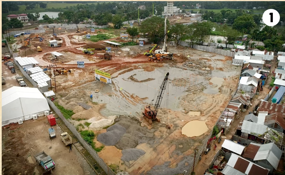
Aerial view of LHP Agartala

Hon'ble Prime Minister Shri Narendra Modi reviewed the progress of Light House Projects (LHPs) on 3rd July 2021 through drones. LHPs are being constructed under the Global Housing Technology Challenge-India (GHTC-India) at six locations. More than 1,000 houses each are being built at six sites- Rajkot (Gujarat), Chennai (Tamil Nadu), Lucknow (Uttar Pradesh), Indore (Madhya Pradesh), Ranchi (Jharkhand) and Agartala ▶