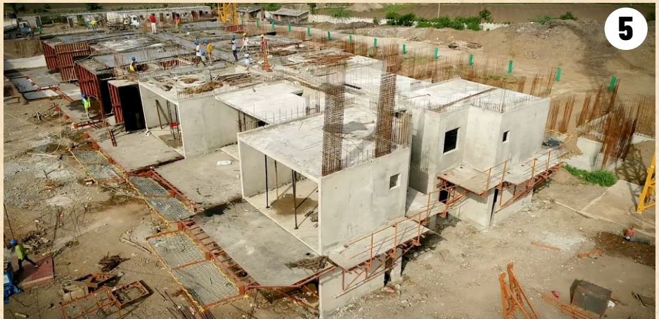
Aerial view of LHP Rajkot

(Tripura) under LHPs which will pave the way for a new eco-system where globally proven technologies will be adopted for cost effective, environment friendly and speedier construction.