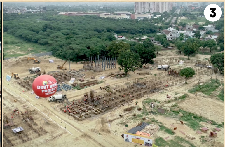
Aerial view of LHP Lucknow