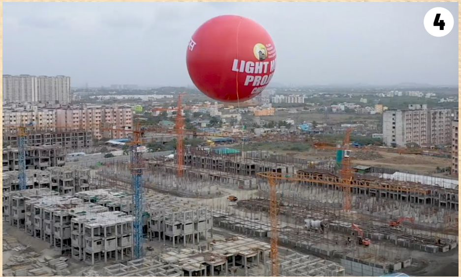
Aerial view of LHP Chennai

At the Mission, ours is a constant endeavour to work for the people. PMAY(U) is not just constructing houses, but helping build the Nation.