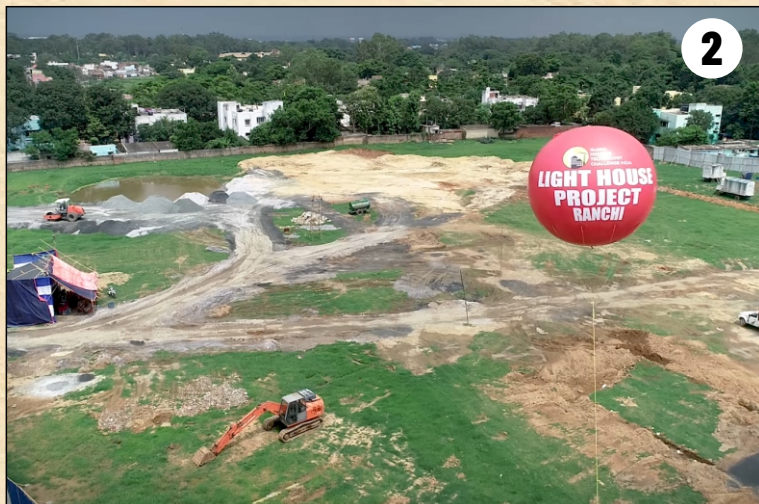
Aerial view of LHP Ranchi